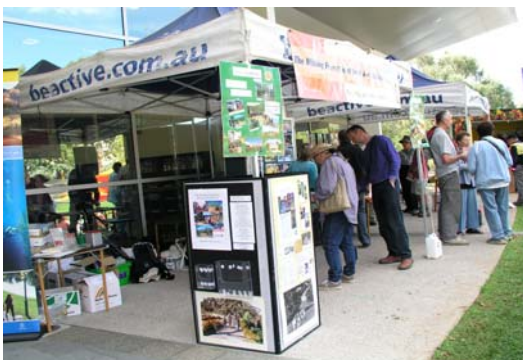
Displays at the Opening of the Walking Season